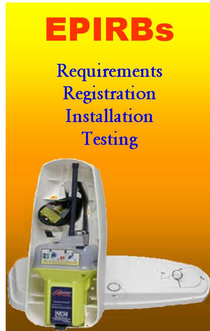
ACR Global fix 406mhz EPIRB